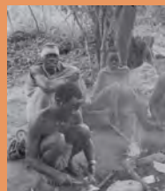
„Hamar customers inside the workshop of a blacksmith“ (Pa 47-5)

Participant observation was also part of their methodology. The team took part in celebrations, observed the daily work involved in farming, herding or craftsmanship.