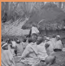
„A bride sits on the right side with her head heavily smeared with butter“ (Wd 35-1)