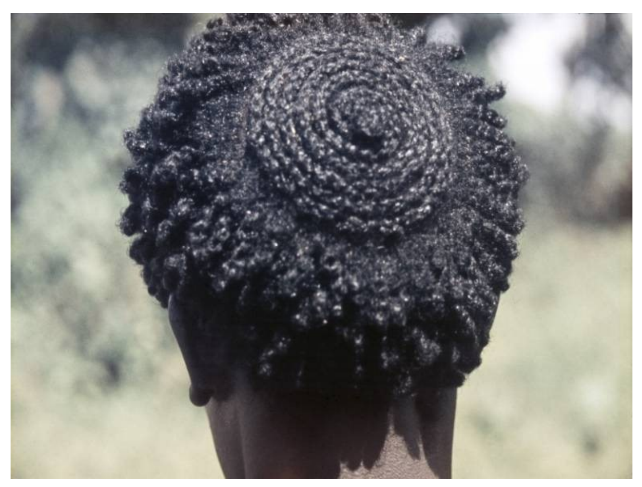
Fig. 2. Spiral braided hairstyle of young men from Alabdu-Gudji, by Eike Haberland, 1954/55 (Photo: © Frobenius Institute, reg. no. FoA 27-KB114-27)

Unfortunately, the hairdressing customs of many ethnic minorities in Ethiopia are often marginalized by the 'dominant' culture or are being supplanted by globalizing trends. Documenting and studying such cultural assets may contribute to their preservation. Unfortunately, aside for some occasional work done by the Authority for Research and Conservation of Cultural Heritage (ARCCH), the subject of hairstyles in Ethiopia has not been extensively studied or documented by Ethiopian institutes. Thus, the documents gathered by researchers from the Frobenius Institute, who described and photographed different social aspects of hairstyles, provide valuable evidence for studying these customs. In addition to photography, sketches were also used for documenting the hairstyles from different ethnic groups of Southern Ethiopia. These materials were later published in the three volumes (see references).