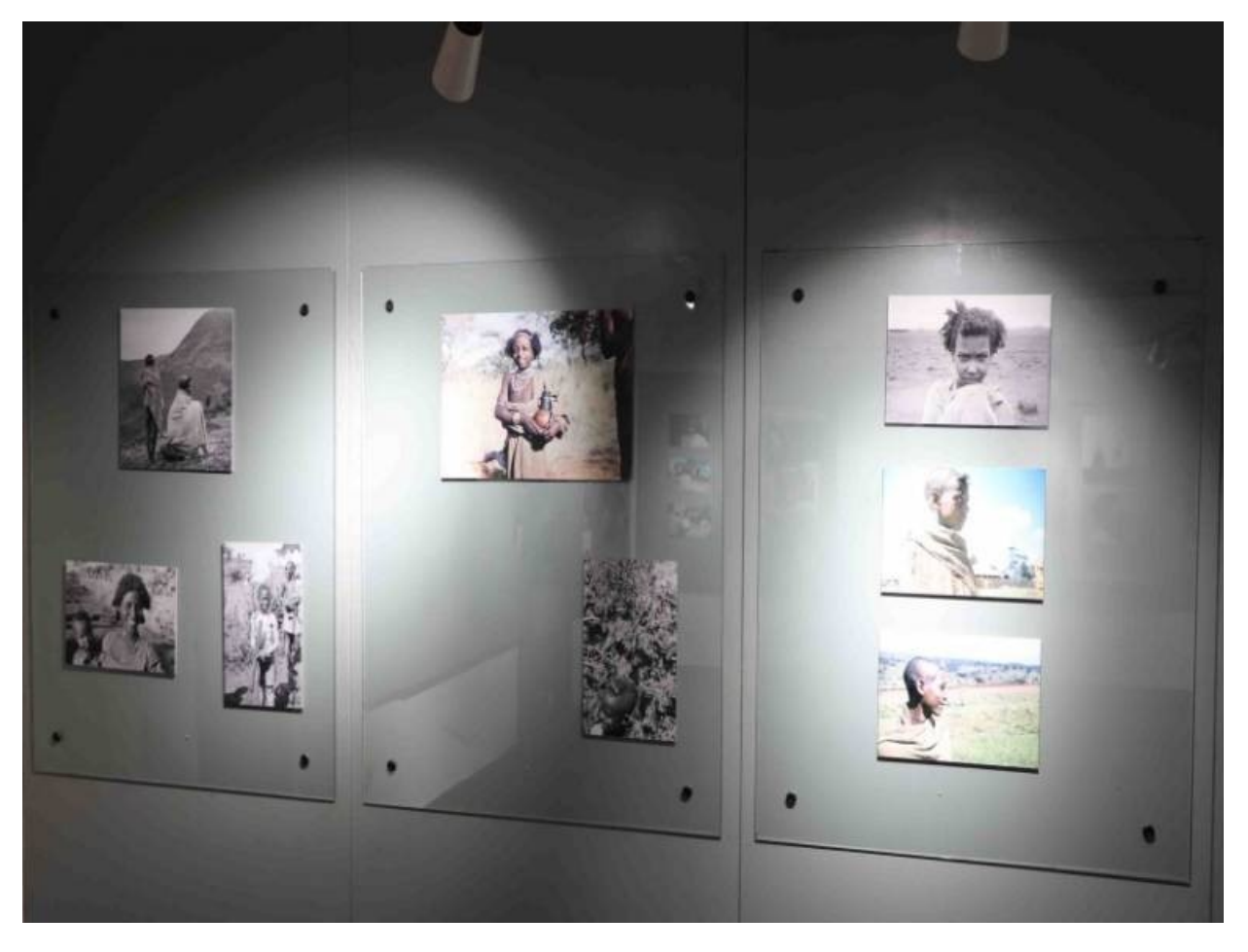
Fig. 3. Some of the photos on show at the exhibition