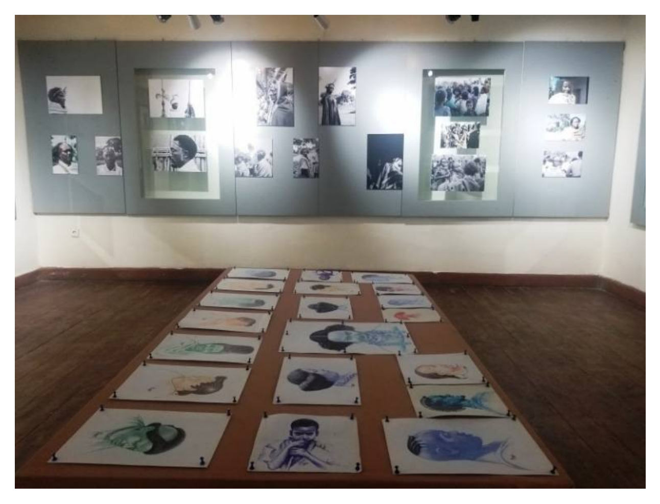
Fig. 4. A general view of the 'The Wax and Gold of Hairstyles in Ethiopia' exhibition