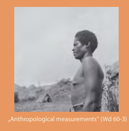
The fields of interest to the expedition were diverse: material culture, kinship, rituals and festivities, economy, myths, but also biological anthropology.